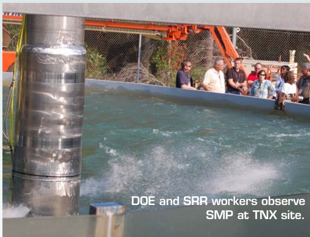
DOE and SRR workers observe SMP at TNX site.

On June 15, DOE-SR managers toured the TNX facility where SRR managers provided them with details on why new pumps are essential to SRR’s goal to operationally and safely close tanks.